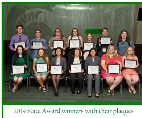
2019 State Award winners with their plaques

Michigan 4-H true leaders ages 11 and older have an opportunity to be recognized for the great work they do in 4-H by completing a state award application. A Michigan 4-H State Award is the highest honor bestowed on a Michigan 4-H member and provides an opportunity to receive recognition for their engagement in rich learning experiences that result in outstanding knowledge and life-skill development.